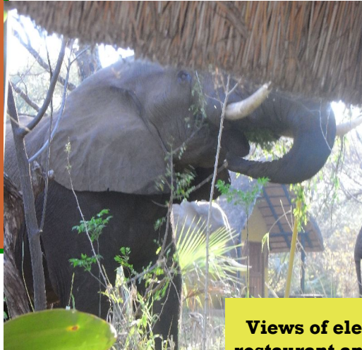
Views of elephants from the restaurant and along the drive

For those who have had their fill of bird watching, elephant gazing or swimming in the natural pool at The Lodge, there is entertainment in the form of Chess, Snakes and Ladders and Dominoes to while away the time (see photos over the page)