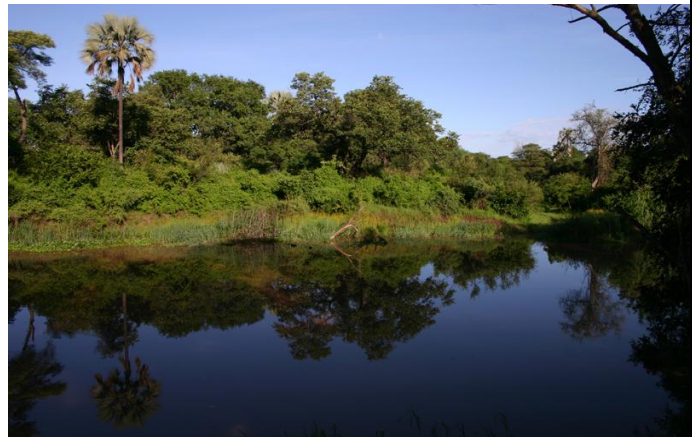
Maramba River