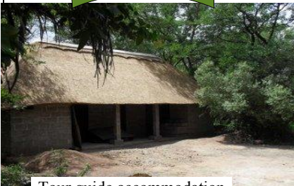
Tour guide accommodation being built