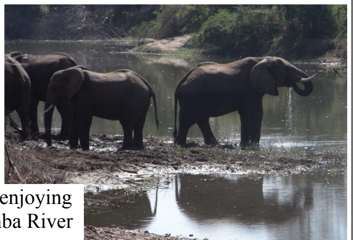
Elephants enjoying the Maramba River