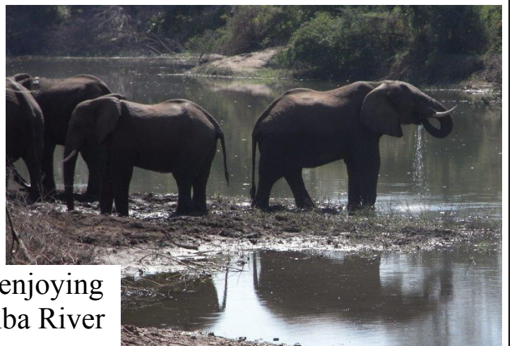
Elephants enjoying the Maramba River