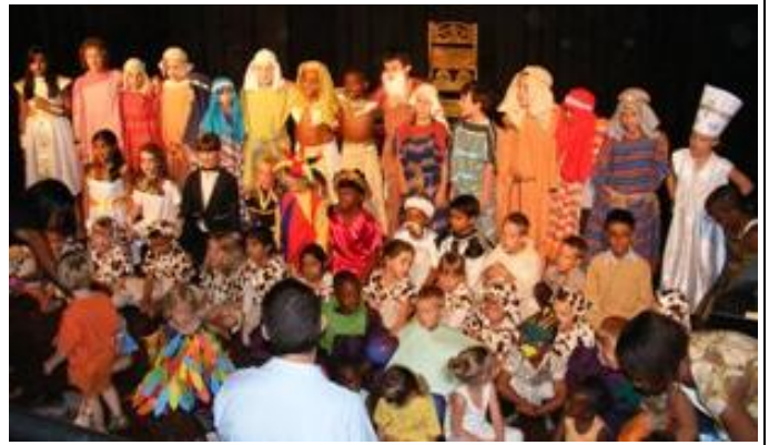
The school's recent production of 'Joseph and his Technicolour Dreamcoat'